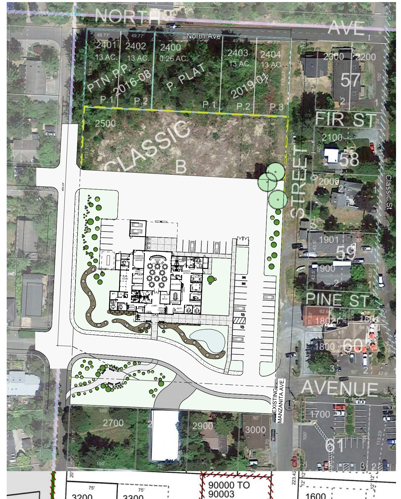
1 SITE OVERVIEW 1" = 30'-0"