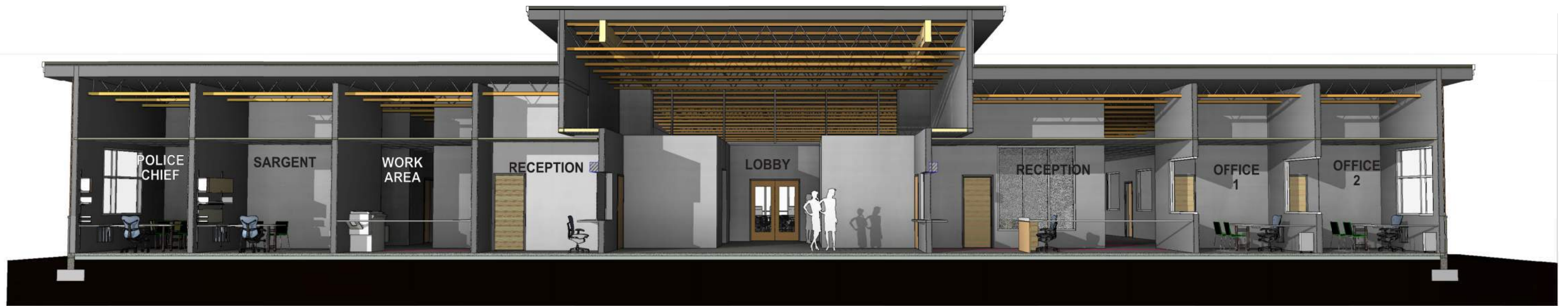
SECTION EAST-WEST THROUGH LOBBY