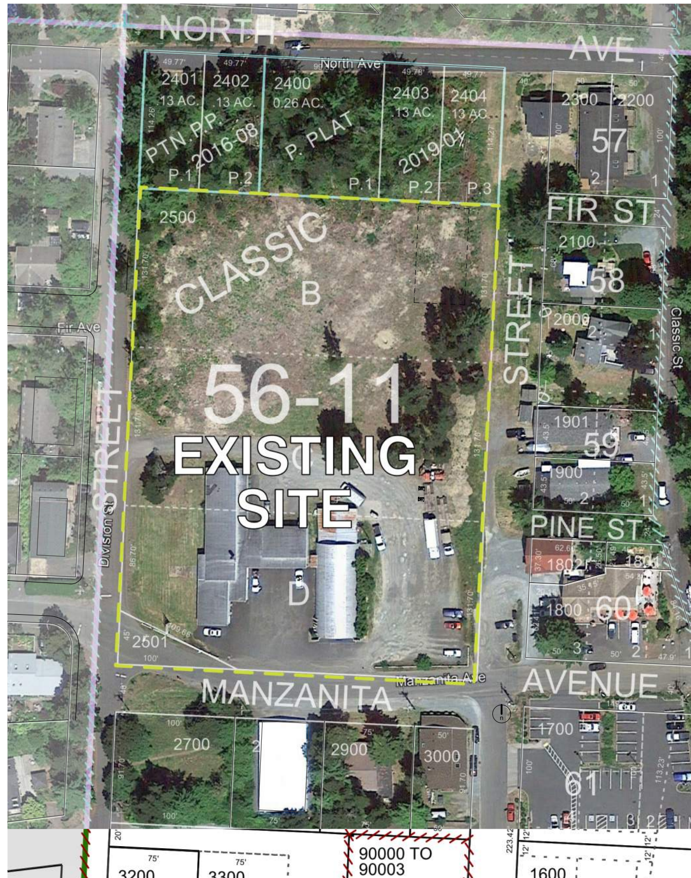
2 SITE OVERVIEW - EXISTING 1" = 30'-0"