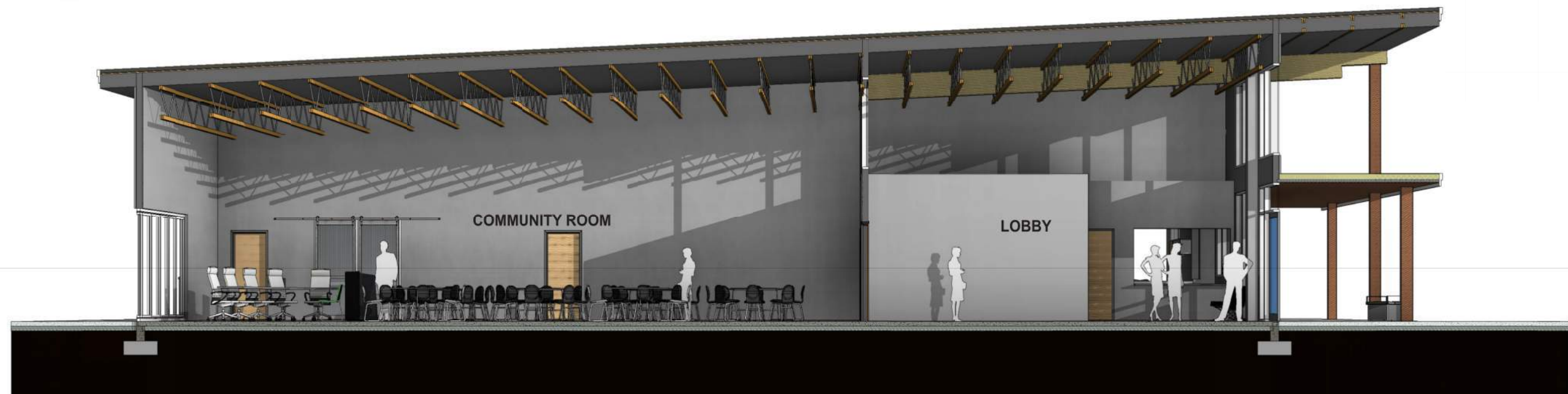
SECTION NORTH-SOUTH THROUGH MEETING HALL