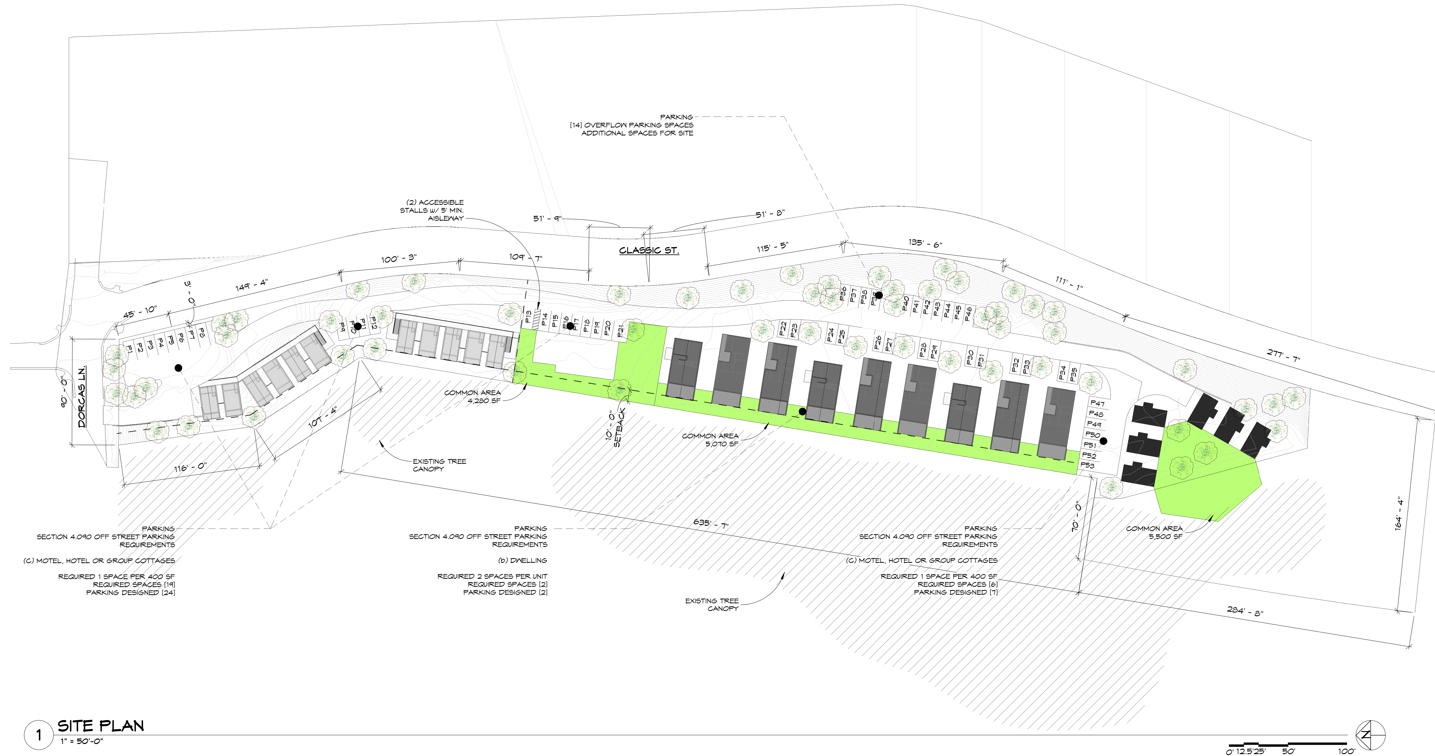
1 SITE PLAN 1" = 50'-0"