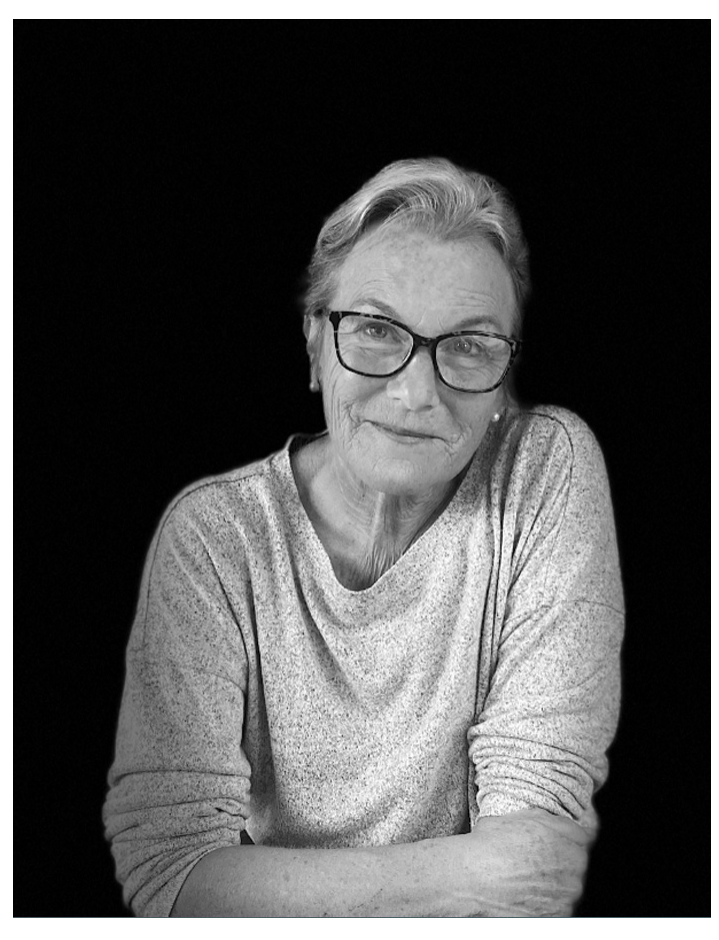
Educational Background BS from Oregon State University MAT from Lewis & Clark College

Manzanita citizens need to move in a clear direction together — setting goals that can be followed in our near and long-term future. Using our assets in a constructive and positive manner while protecting our environment - natural and built - is the key to executing those goals.