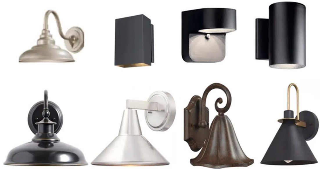
Types of Outdoor Lighting That Can Be Used

A light fixture that has a solid barrier at the top of the fixture in which the lamp (bulb) is located. The fixture is angled so the lamp is not visible below the barrier at a horizontal plane.