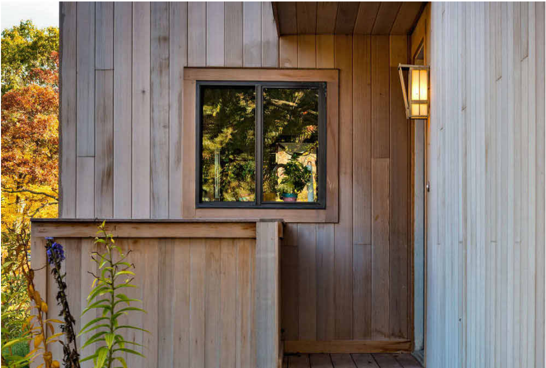
VERTICAL CEDAR SIDING, DARK COLOR WINDOW FRAMES