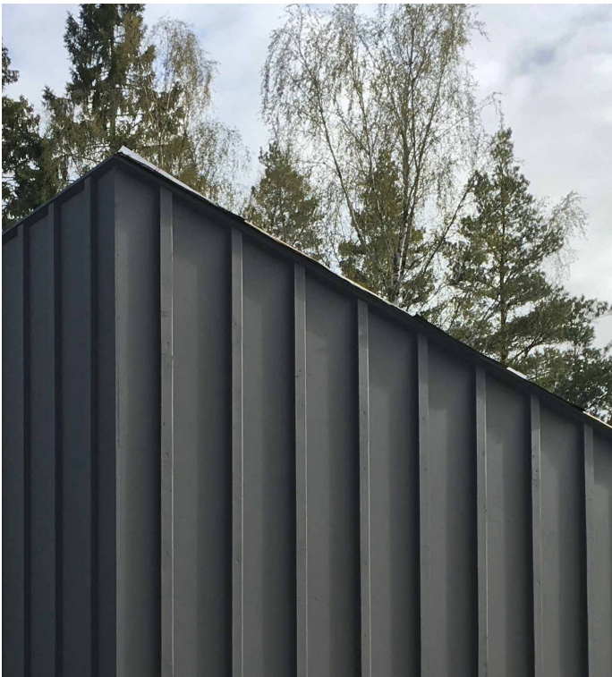
BOARD & BATTEN SIDING AT ENTRY, CONTRASTING COLOR