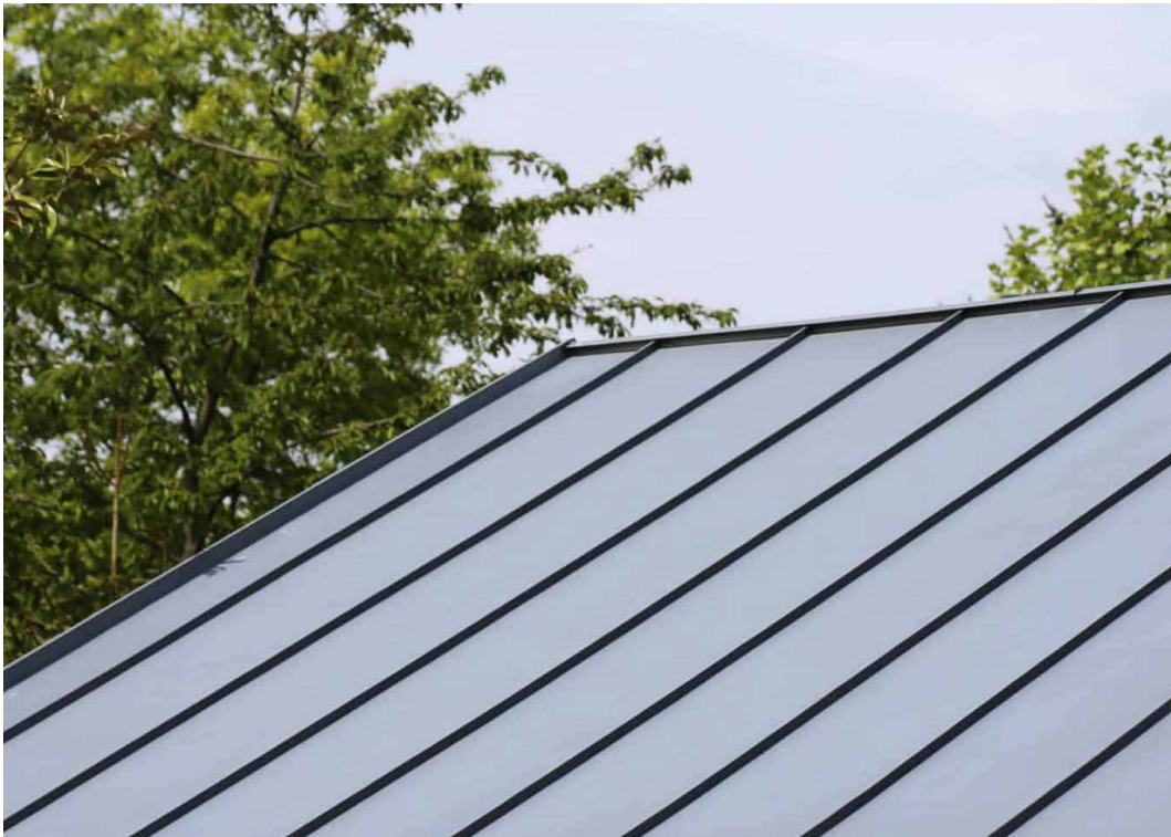
STANDING SEAM METAL ROOF - DARK COLOR